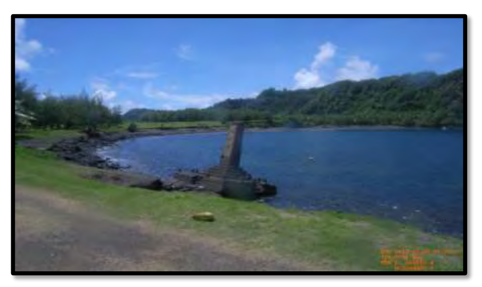
Photo 3.12-22. View of Inland Brackish Lagoon near Green Beach with a Japanese Monument in Foreground

Natural features that dominate the North Pagan area include Mount Pagan, and two brackish, inland lakes (Figure 3.12-2 and Photo 3.12-22).