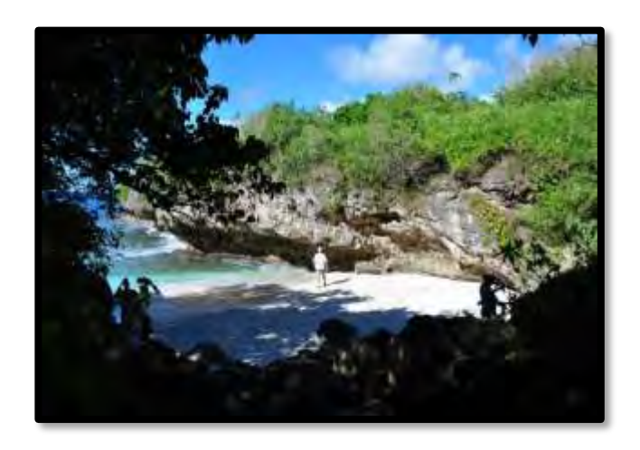
Photo 3.12-5. Key Observation Point 4 – View of Rocky Coast and Narrow Expanse at Unai Lam Lam