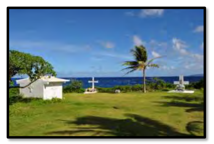
Photo 3.12-6. Key Observation Point 5 – View North toward Saipan from Ushi "Cross" Point

Ushi "Cross" Point A (Photos 3.12-6 and 3.12-7) is the northern-most point of the island. It contains several memorials to various residents from Tinian, primarily fishermen. These whitewashed memorials are in sharp contrast to the natural surroundings that consists of a landscape of green, low vegetated ground cover, and the ocean with the island of Saipan in the distance. The area also contains a small three-sided memorial chapel and a maritime navigational aid beacon on a concrete base. It is exposed to a nearly continuous breeze from the trade winds coming off the ocean, which also create windswept vegetation along the shoreline and whitecaps in the waters offshore. Unlike other parts of Tinian, the shoreline immediately around the point contains no large jungle areas, only low shrubbery and ground cover. This allows expansive views from east to west including the Philippine Sea and the island of Saipan.