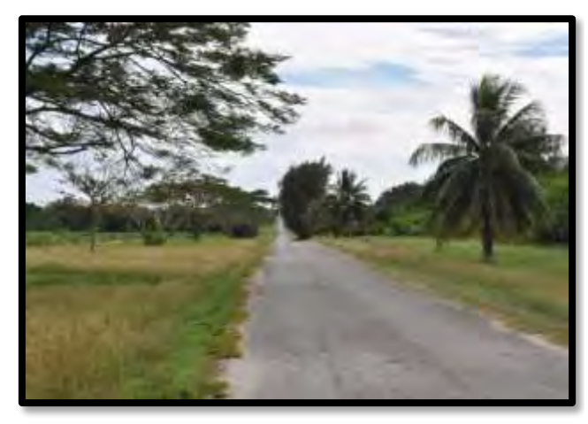
Photo 3.12-19. Key Observation Point 13 – Broadway Avenue Looking South with Carolinas Plateau in the Background