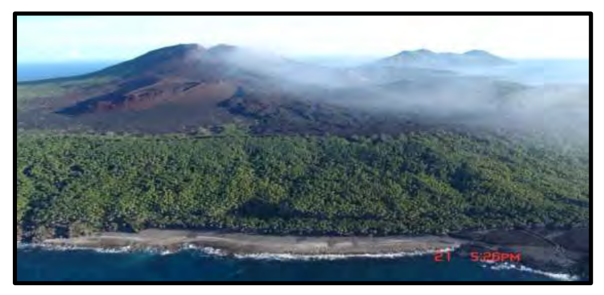
Photo 3.12-23. View of North Pagan (looking south) showing Mount Pagan and Landscape

The active volcano at the center of the North Pagan provides a unique landmark visible from most parts of the island, as its caldera emits a stream of gasses on a near-continual basis. The 1981 volcanic eruption of Mount Pagan left the landscape of northern Pagan with large areas of barren lava, surrounded by vegetation (Photo 3.12-23). The north shoreline of Mount Pagan is covered by dense, green vegetation that becomes less dense as one moves inland towards Mount Pagan. The barren lava areas provide a dark gray or black landscape. The western shoreline of North Pagan is dominated by a large black sand beach and contiguous brackish water lake just inland from the shore. The eastern shoreline of North Pagan has rockier beach areas and steeper terrain that is less accessible from inland areas.