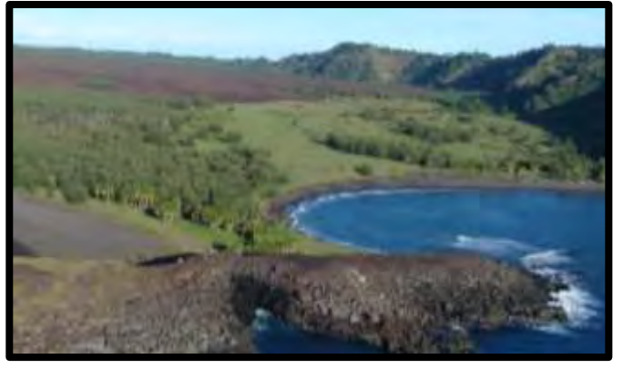
Photo 3.12-24. North Pagan Landing Strip (looking east) with Green Beach in the forefront

grass landing strip was covered by a massive lava flow as a result of the 1981 volcanic eruption of Mount Pagan. This lava flow covered much of the landing strip with approximately 20 feet (6.1 meters) of lava, rendering the landing strip severely impaired. This rugged and barren lava flow provides a sharp contrast to both the vegetated area found at its immediate periphery and the large conical volcano in the background. Remnants of World War II Japanese equipment (guns, airplanes) and structures (bunkers) are still evident in North Pagan,