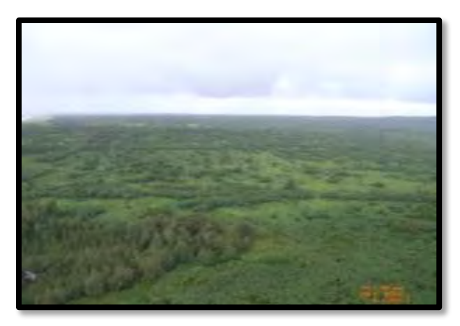
Photo 3.12-16. Aerial View of East Tinian Looking West with the Airport in the Distance at the Upper Left Corner

This point is just north of the Tinian International Airport, where 8<sup>th</sup> Avenue turns directly north after bordering the airfield. The scenery changes from a completely cleared airfield and surrounding area of maintained low ground cover to a dense jungle extending along both sides of 8<sup>th</sup> Avenue as it heads north (Photo 3.12-15). The development in this area consists of fenced agricultural fields and a small pull-off to allow for access to the water filling station. This roadway serves as a primary route to the National Historic Landmark at North Field.