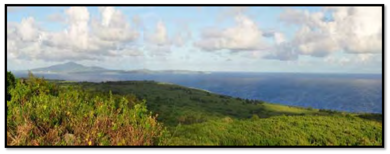
Photo 3.12-13. Key Observation Point 8 – View from Mount Lasso Scenic Lookout North to Saipan

eastern half of Tinian with Saipan in the background to the north, where development on the south end of Saipan is visible (Photo 3.12-13).