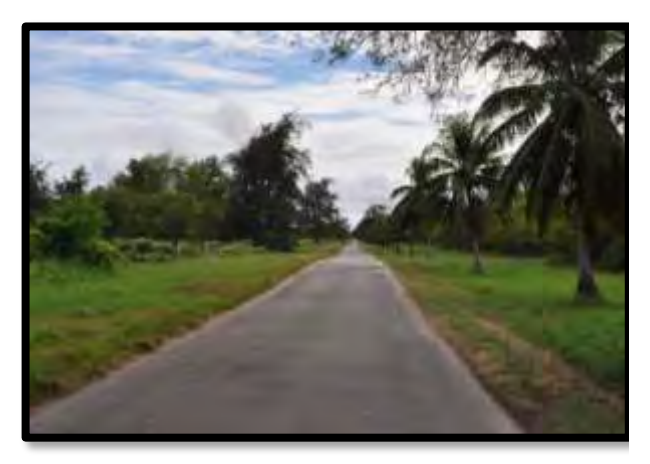
Photo 3.12-17. Key Observation Point 11 – Broadway Avenue Looking North

Along this stretch of Broadway Avenue, tall vegetation has been cleared out to a distance of 600 feet (180 meters) on both sides of the roadway, allowing light to penetrate (Photo 3. 12-17). These cleared strips contain palm trees that were planted in a linear configuration when the road was built during World War II. The cleared conditions provide a more expansive viewshed in both northward and southward directions than those seen along many of the other existing roads. These views are seen as one travels along the roadway from San Jose to the American memorial round-about. Broadway Avenue is a primary north-south road utilized by both visitors and residents.