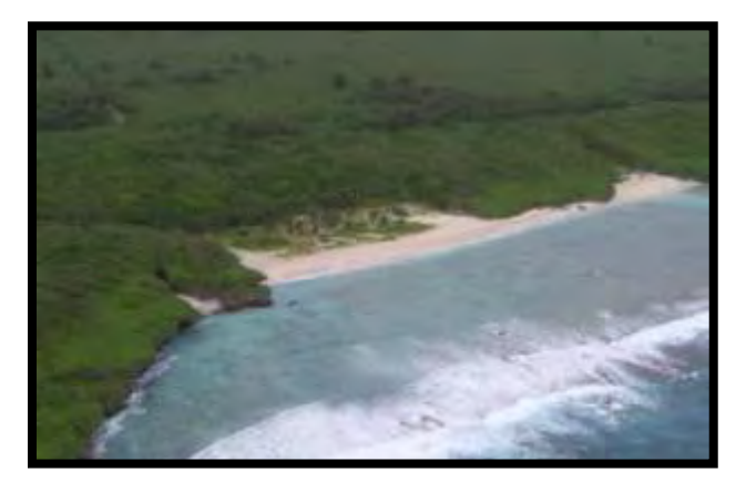
Photo 3.12-20. Key Observation Point 14 – West toward Unai Dankulo

Like Unai Lam Lam and Unai Babui, this beach is accessible via a narrow rocky foot trail (Photo 3.12-21). The beach itself is a narrow cove, fringed by large rock outcroppings. The beach provides views northeast to Saipan and some limited views of Tinian's eastern coast to the north and south. This beach is small, less open than Unai Dankulo,