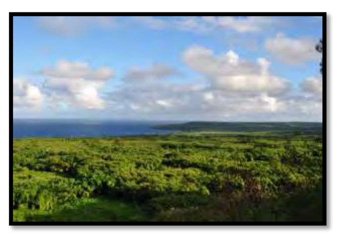
Photo 3.12-14. Key Observation Point 9 – View from Mount Lasso Scenic Lookout Southeast toward the Pina Plateau in South Tinian

This area consists of the central plateau east of the escarpment flanking the Mount Lasso area just east of Broadway Avenue (Photo 3.12-16). Like the central plateau in west Tinian, it is a layered limestone plateau mostly blanketed by dense vegetation. Some areas of fenced, semicleared agricultural lands are located in this area. Street trees along Broadway Avenue provide an impression of this area during the World War II era. The Broadway Avenue corridor traverses the island in a north-south direction and is an important route that connects the memorials,