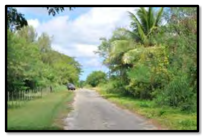
Photo 3.12-15. Key Observation Point 10 – Looking North on 8<sup>th</sup> Avenue South Towards the Airport

Views to the southeast (Mount Lasso Scenic Lookout B) provide a view of the jungle landscape, eastern coast of Tinian, Pina Plateau and the Pacific Ocean (Photo 3.12-14). Views to the west are blocked by dense vegetation. Due to a topographical plateau below the lookout in the middle-ground, the views of Broadway Avenue and structures along the route are blocked. Areas to the south, including the village of San Jose, are not visible from the Mount Lasso Scenic Lookout.