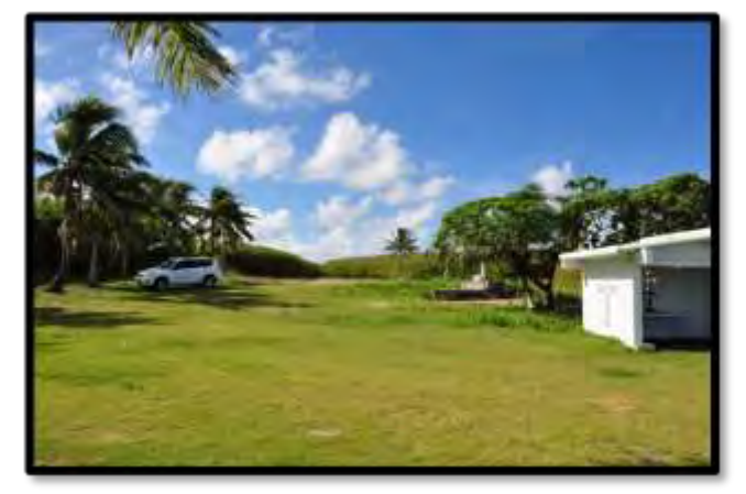
Photo 3.12-9. Key Observation Point 6 – View Looking South from Ushi "Cross" Point