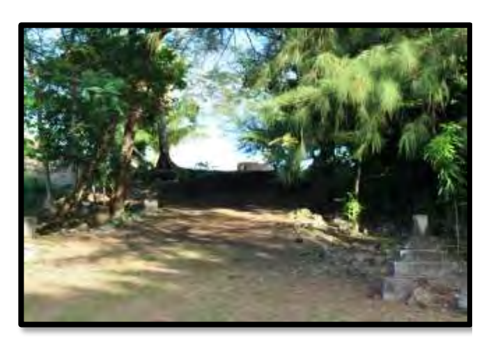
Photo 3.12-12. Mount Lasso Tower at Top of Hill with Remnants of Shinto Shrine in Foreground

Views to the northeast (Mount Lasso Scenic Lookout A) afford a panoramic view over the