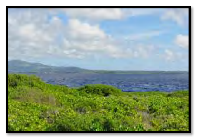
Photo 3.12-7. Key Observation Point 5 – Saipan across Channel from this View near Ushi "Cross" Point

Ushi "Cross" Point B (Photos 3.12-8 and 3.12-9) is in the same location as Key Observation Point 5 described above, but is directly south and facing away from the ocean. This view mostly consists of a green, low vegetated ground cover. The memorials and a U.S. Geological Survey navigational aid facility are in the foreground, and a gently sloping trail leading through a forested area is in the middle-ground.