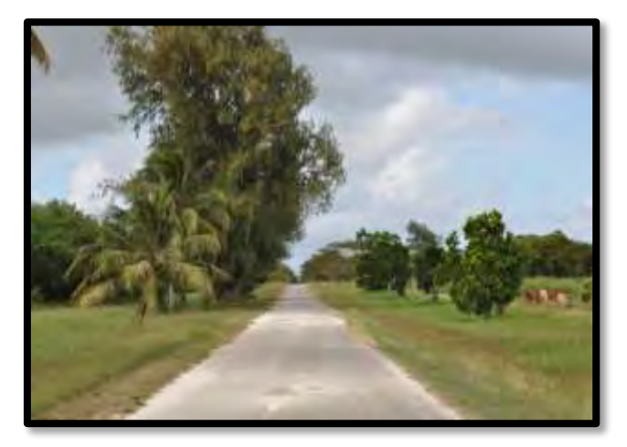
Photo 3.12-18. Key Observation Point 12 – Broadway Avenue Looking North