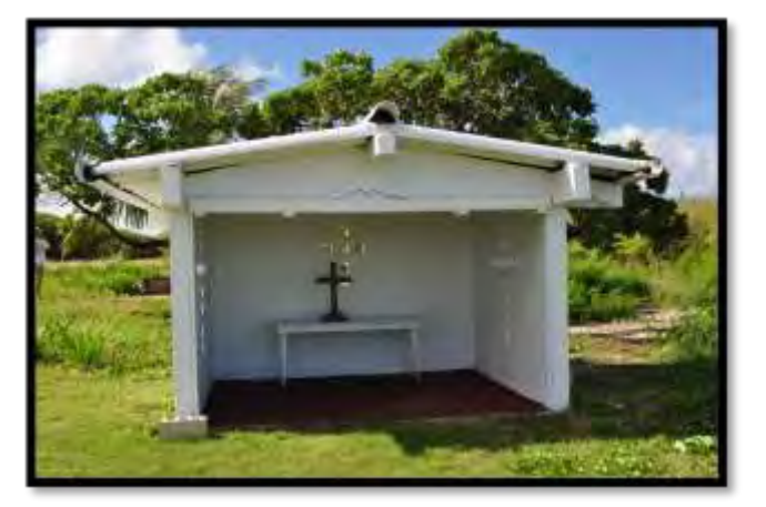
Photo 3.12-8. Key Observation Point 6 – Memorial Chapel at Ushi "Cross" Point

Ushi "Cross" Point B (Photos 3.12-8 and 3.12-9) is in the same location as Key Observation Point 5 described above, but is directly south and facing away from the ocean. This view mostly consists of a green, low vegetated ground cover. The memorials and a U.S. Geological Survey navigational aid facility are in the foreground, and a gently sloping trail leading through a forested area is in the middle-ground.