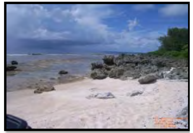
Photo 3.12-3. Key Observation Point 2 – View of Beach Area and Expansive View Corridor of Unai Chulu