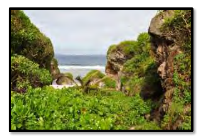
Photo 3.12-21. Key Observation Point 15 – East toward the Shoreline and Unai Masalok